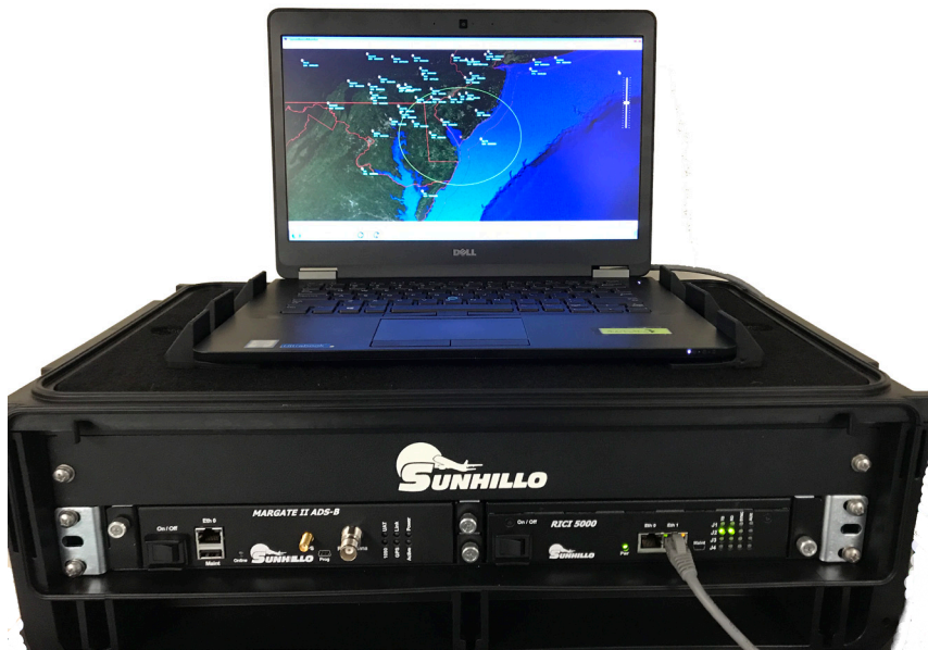
Primary Tactical Kit